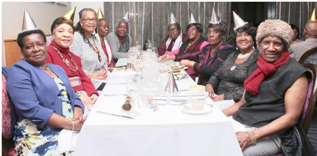
End of year Opportunity Knocks presentation evening 2016

All service users were invited to comment on the project service delivery. A number of people attended the PAG meetings intermittently with a core of six people attending on a regular basis. Once the initial start up phase was complete, and it was clear to the service users that they had ownership of the project the number of formal meetings was reduced. The PAG met three times in Year 1, once in Year 2 and once in Year 3. However appreciative feedback from participants confirms that informal meetings were held at every opportunity.