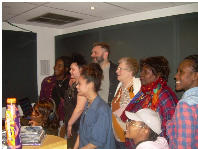
Brit School collaboration with Opportunity Knocks 2016

Feedback from the project participants compliments A.S.K.I on their sensitive delivery style, and the organisational ethos that all activities should be user led is greatly appreciated. This undoubtedly gave rise to a very high number of word of mouth recommendations, which increased the reach of the project even further than was anticipated.