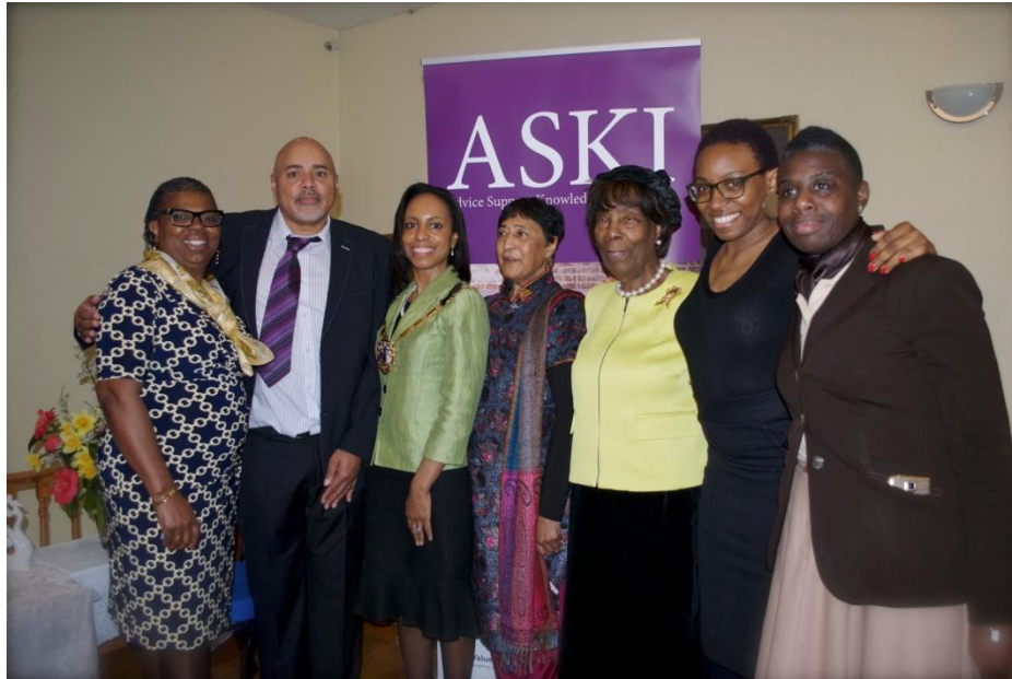
Mayor of Croydon attends ASKI Opportunity Knocks certificate presentation 2016

Analysis of individual participants "project journey" highlights the value of outreach work. The importance of this first step, supporting and encouraging people to engage with the project cannot be overstated because once they were part of the project people benefited from additional information advice and guidance in relating to other areas of their lives. For example, individuals from the job centre who were recruited onto training programme then benefitted from signposting to existing services and support they had previously either been unaware of, or, more worryingly, been vaguely aware of, but believed they were not entitled to the support.