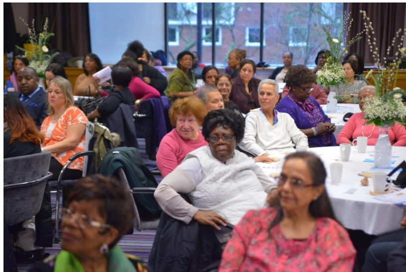
Opportunity Knocks Health Watch Event 2017

4) BMER older people will have a greater input on the issues and strategies that affect them